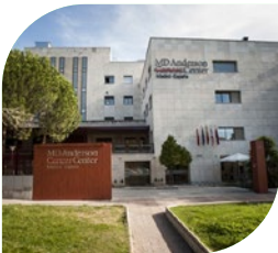
Hospital MD Anderson