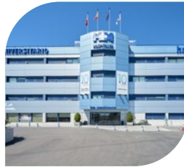
Hospital Madrid Norte Sanchinarro