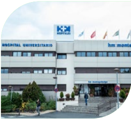
Hospital Madrid Montepíncipe

Cigna Healthcare puts at your disposal one of the most prestigious and extensive medical service networks , with more than 49,650 professionals and 1,942 hospitals and private clinics in Spain .