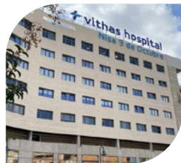
Hospital 9 de Octubre