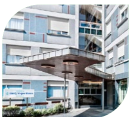
Clínica Virgen Blanca