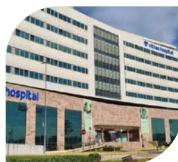
Hospital Vithas Sevilla- Aljarafe