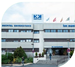
Hospital Madrid Montepíncipe

Cigna Healthcare offers you one of the most prestigious and extensive network of contracted medical services , with more than 49,650 specialists and 1,942 hospitals, medical centres and private clinics in Spain.