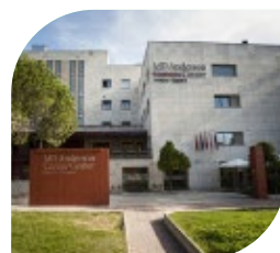
Hospital MD Anderson