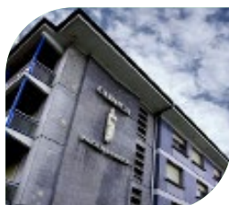
Clínica Virgen Blanca