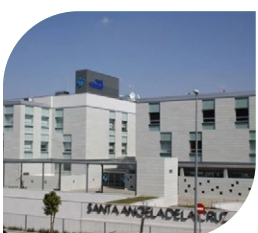
Hospital Viamed Santa Ángela de la Cruz