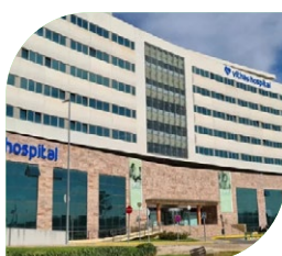
Hospital Vithas Sevilla