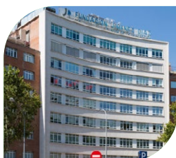
Fundación Jiménez Díaz