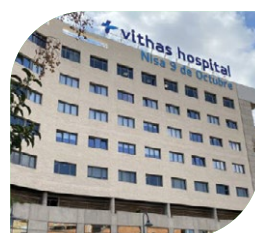
Hospital Vithas Valencia