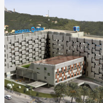
Hospital Quirón (BARCELONA)