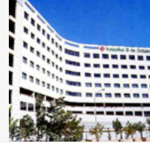
Hospital 9 de Octubre (VALENCIA)