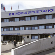
Hospital Madrid Montepríncipe (MADRID)

Cigna puts at your disposal one of the most prestigious and extensive medical service networks, with more than 44,000 professionals and 1,900 hospitals and private clinics in Spain.