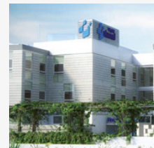
Hospital Viamed Santa Ángela de la Cruz (SEVILLA)

For more details, consult the Medical Network in our website: