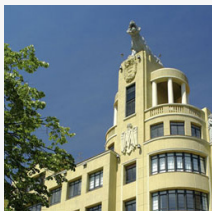
Hospital Quirón (BILBAO)