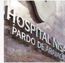
Hospital NISA Pardo de Aravaca (MADRID)