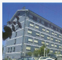
Clínica Virgen Blanca (BILBAO)