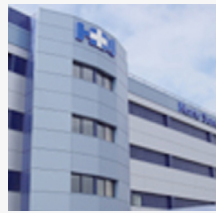
Hospital Madrid Norte Sanchinarro (MADRID)