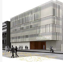
Clínica Corachán (BARCELONA)