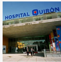
Hospital Quirón (MADRID)